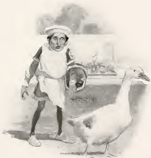
The goose sought in vain for the herb. (P. 149.)

As soon as he was in the open he placed Mimi carefully on the ground and she at once began to run towards the lake on the banks of which the chestnut